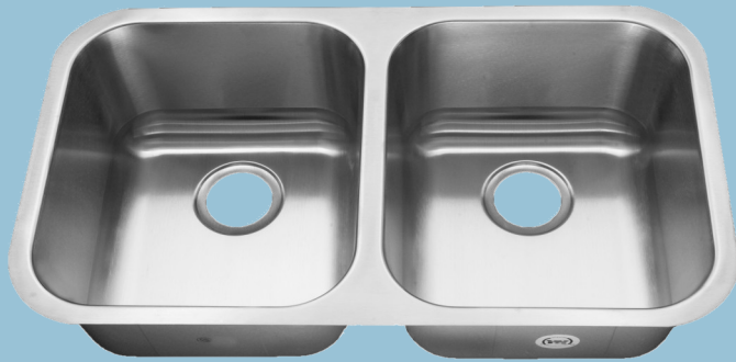
Model R01 50/50 Dimensions 31 1/4" x 18" Depth 9'9"