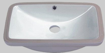
Model CH-433 23 7/8 x 15 x 5 3/4

More Sinks Available .....Ask your sales associate!