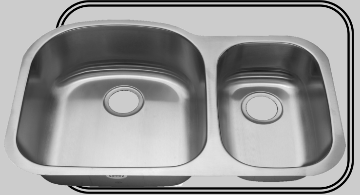
TU004 'Ventura' TU005 Reverse Option Size 31 1/2" x 20 1/2" Depth 9" and 7"