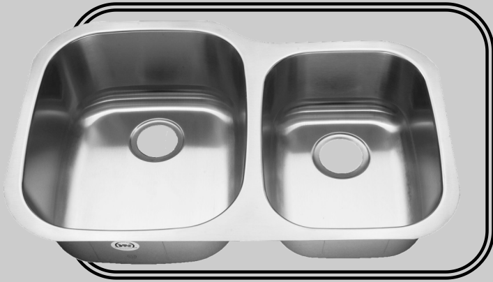
TU002 'Atlas' TU003 Reverse Option Size 31 1/4" x 20 1/2" Depth 9" and 8"