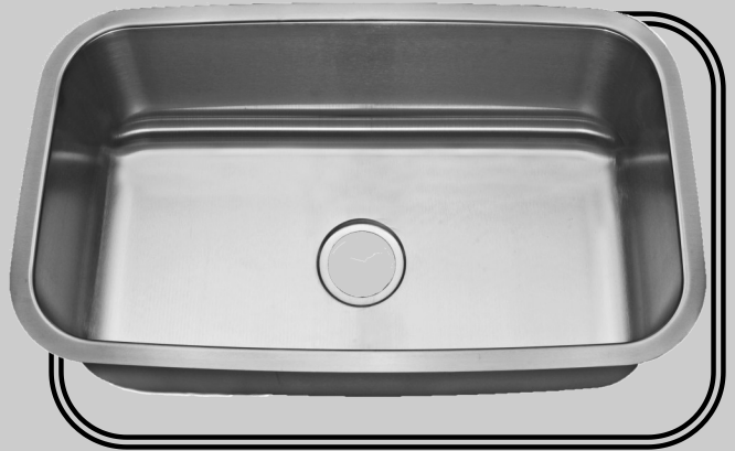
TU006 'Vallant' Size 31 3/4" x 18" Depth 9"