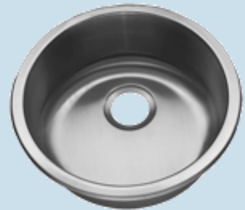
Model TU0905 18 1/2 Depth 7"