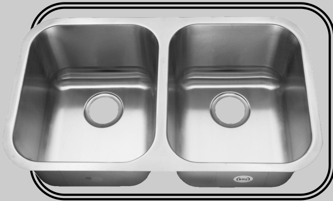
TU001 'Hercules' Size 31 1/4" x 18" Depth 9" and 9"

These Kitchen Stainless Steel sinks are: