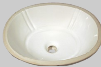
Model CH-400 18 x 14 x 5 1/4