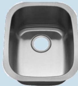
Model R010 15 X1 8 Depth 7"