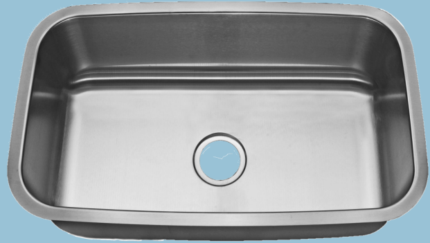
Model LE-199A Single Dimensions 31 3/8" x 18 1/4" Depth 9'