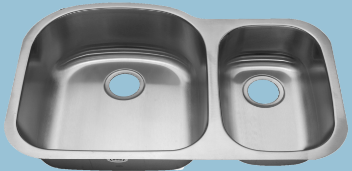
Model R04 70/30 R05 30/70 Dimensions 31 5/8 20 1/2" Depth 9'7"