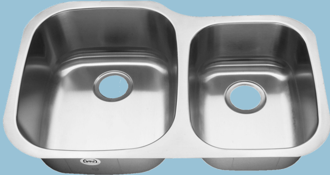
Model R02 60/40 R03 40/60 Dimensions 31 1/4 x 20 1/2" Depth 9'7"